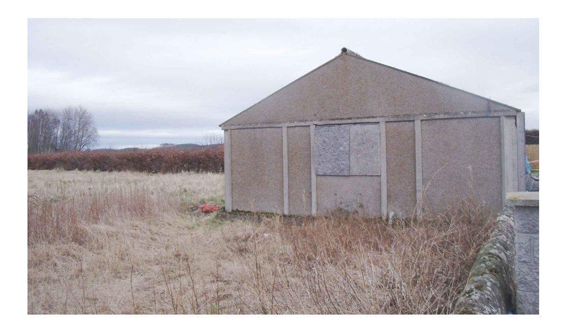
Existing Building within the Site Current Situation