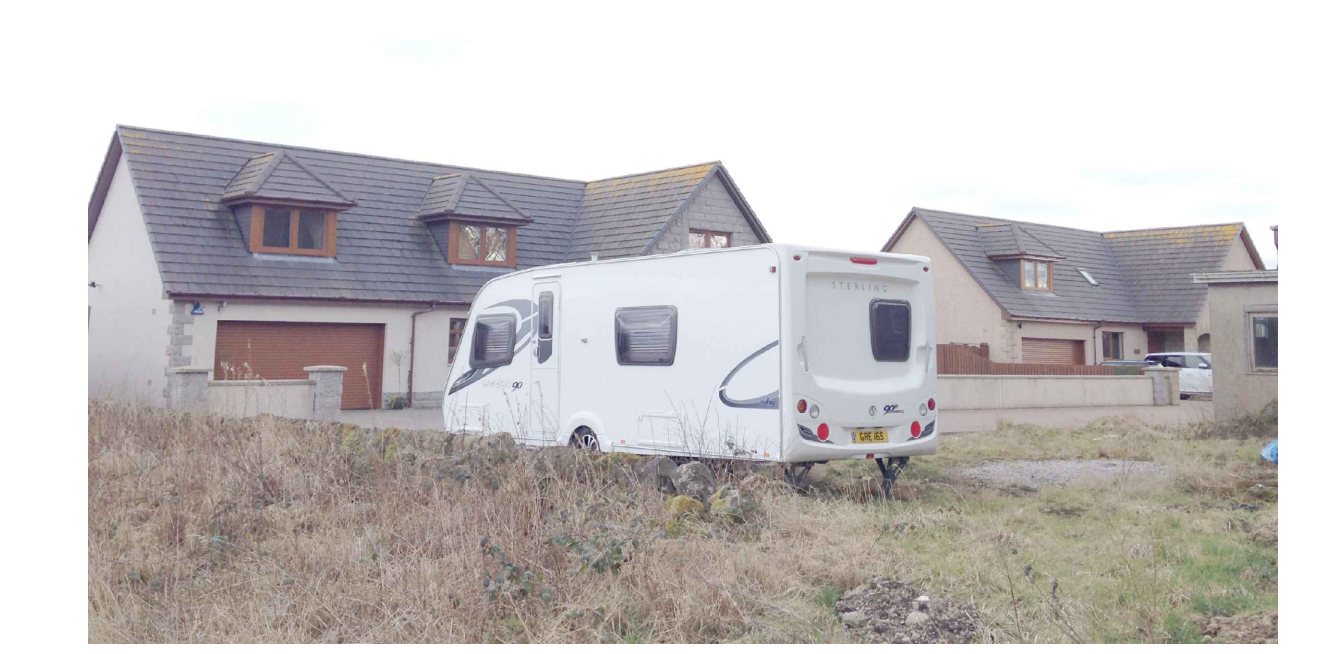
Dwellings Adjacent to the Site Current Situation