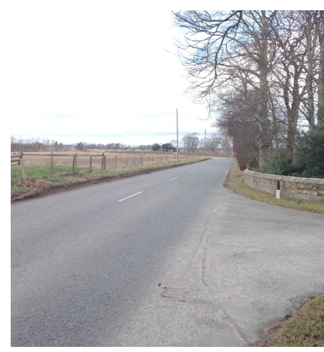
Visibility looking north Current Situation