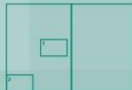
1: Self catering units, near Auchtermadar, Perth & Kinross 2: Contemporary artist's studio and home, Perth & Kinross