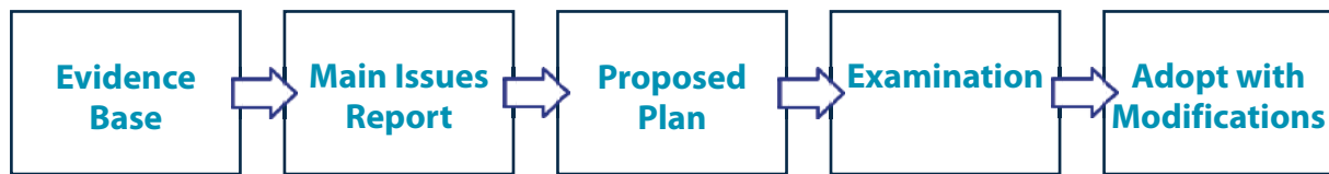
Diagram 1: the key stages of LDP preparation.