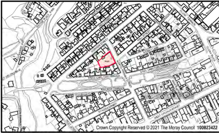
LOCATION PLAN SCALE 1:5000