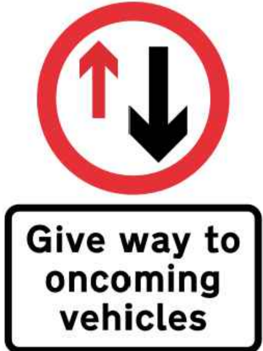
SL002 (DIAGRAM NO. 615) SIGN DETAIL