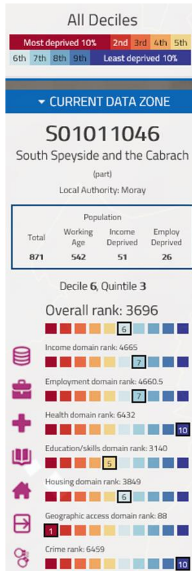
Table 2. SIMD 2020 Ranking - South Speyside and Cabrach

The Scottish Index of Multiple Deprivation (SIMD) is a measure of deprivation across 6,976 data zones. SIMD ranks data zones from most deprived (ranked as 1) to least deprived (ranked as 6,976) and the Inveravon data zone (South Speyside and Cabrach) is ranked at 3696. Within this ranking geographical access is the biggest level of deprivation, followed by Education/Skills. Income and Employment are relatively good while Crime and Health are ranked as the least deprived. A graphical breakdown of this information is below.