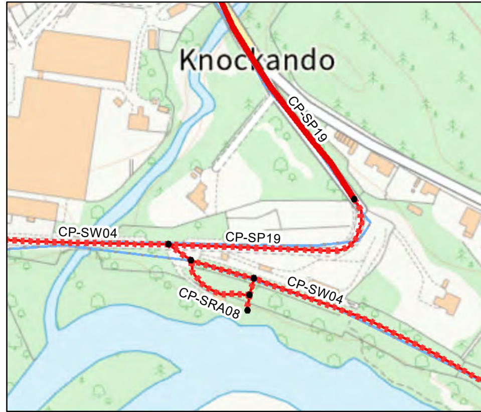
SRA 08: Knockando - Tamdhu For wider view see map 31 Scale 1:2,500