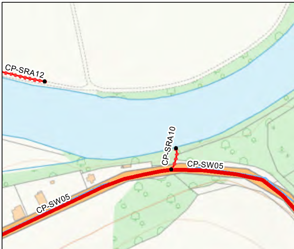
SRA 10: Cragganmore For wider view see map 33 Scale 1:2,500