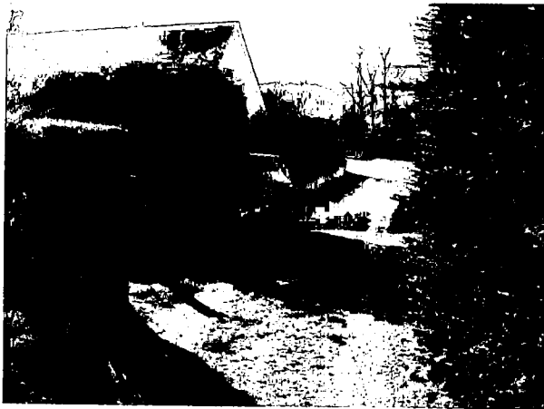
Looking down the unmade track from Brylach Entrance to site is on the left between the hedges