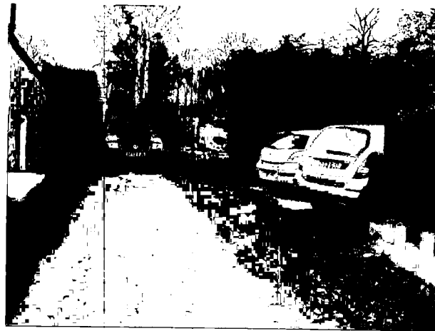
Looking up the track from Walkers Crescent Entrance to the site is between the car and the hedge