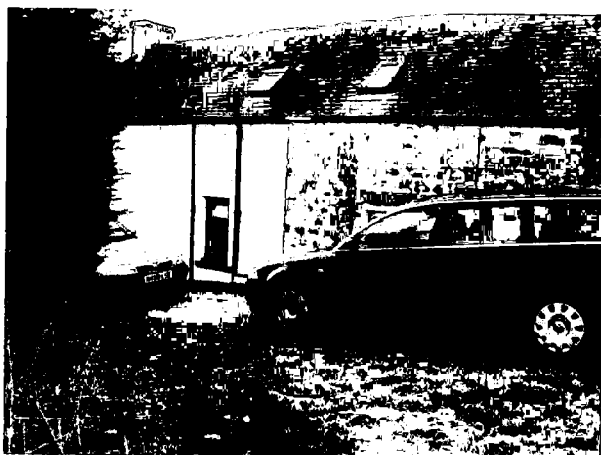
Looking from the site to the track