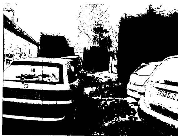
Footpath joins the track between the small hedge and the fence post