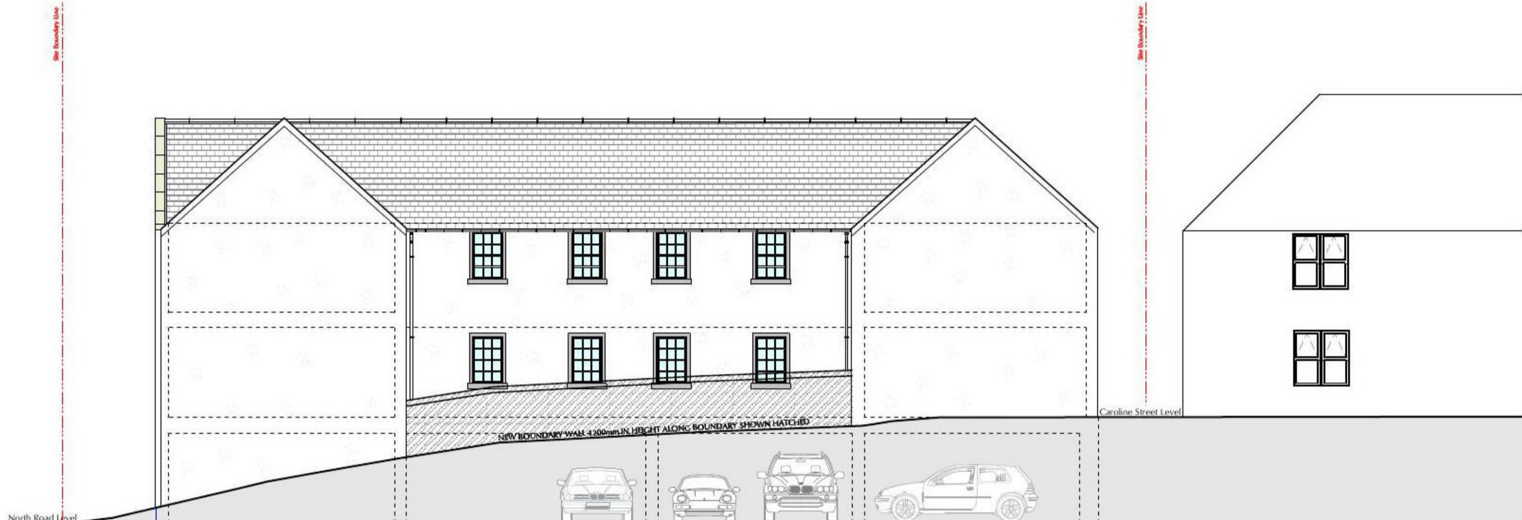
REAR ELEVATION - SCALE 1:100

Town & Country Planning (Scotland) Act, 1997 as amended REFUSED 12.10.11 Development Management Environmental Services The Moray Council