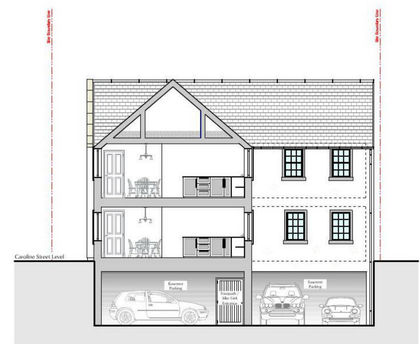
INTERNAL (SOUTH-EAST) ELEVATION - SCALE 1:100