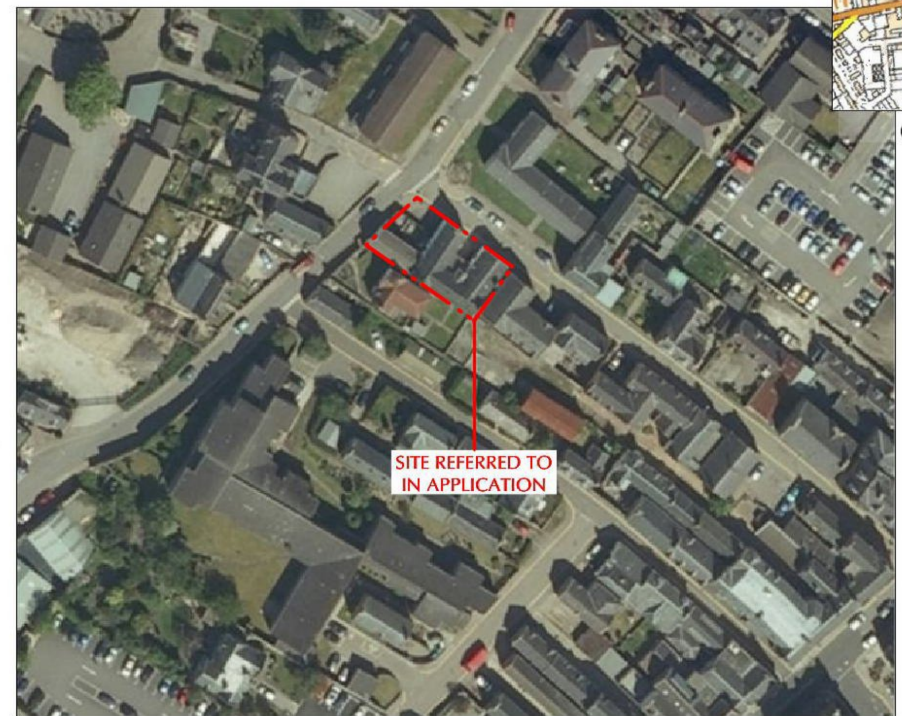
AERIAL PHOTOGRAPH - N.T.S