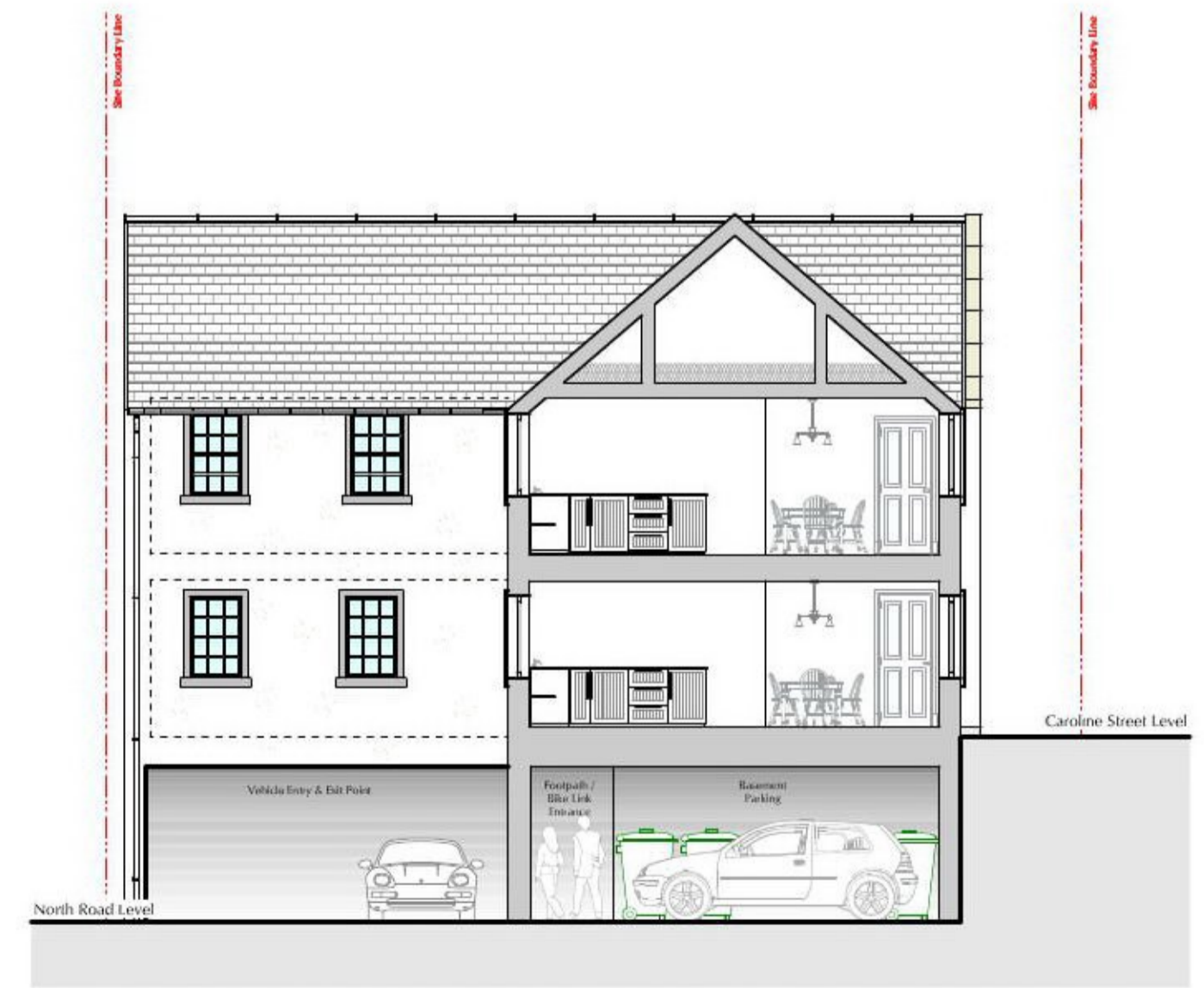
INTERNAL (NORTH-WEST) ELEVATION - SCALE 1:100