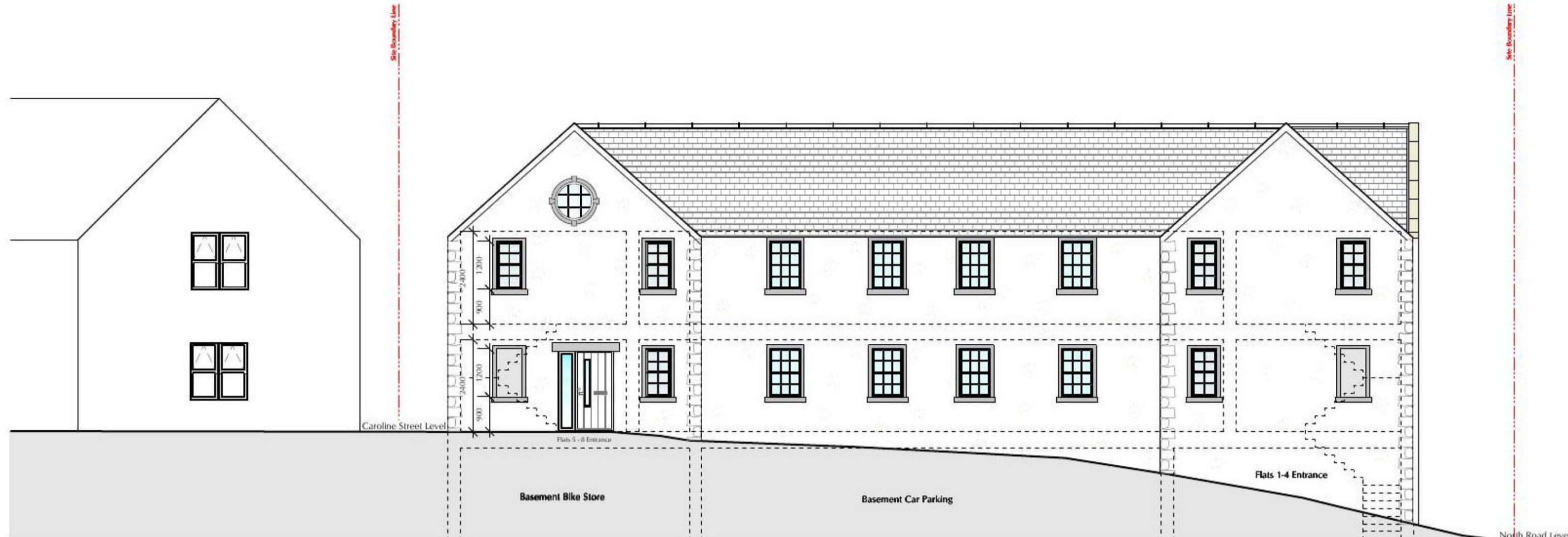
CAROLINE STREET ELEVATION - SCALE 1:100

DO NOT SCALE OFF DRAWINGS. ALL SIZES ARE TO BE CHECKED CONFIRMED ON SITE PRIOR TO COMMENCEMENT OF WORKS/ORDERING OF MATERIALS. NO WORK TO COMMENCE BEFORE APPROPRIATE APPROVALS ARE GRANTED. CONTRACTORS RESPONSIBILITY TO ENSURE POSSESSION OF APPROVED DRAWINGS.