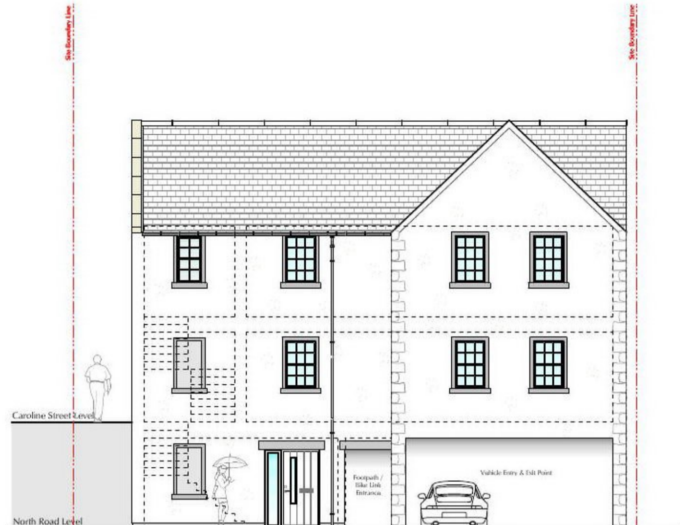
NORTH ROAD ELEVATION - SCALE 1:100

MATERIAL AND FINISHES SPECIFICATION WALL FINISH - WHITE WET DASH FINISH ROOF FINISH - DARK SLATE EFFECT TILE WINDOWS FINISH - HIGH PERFORMANCE TIMBER TRIPLE GLAZED WINDOWS, COLOURATION TO PLANNING AUTHORITY APPROVAL DOOR FINISH - HIGH PERFORMANCE TIMBER DOORS, COLOURATION TO PLANNING AUTHORITY APPROVAL