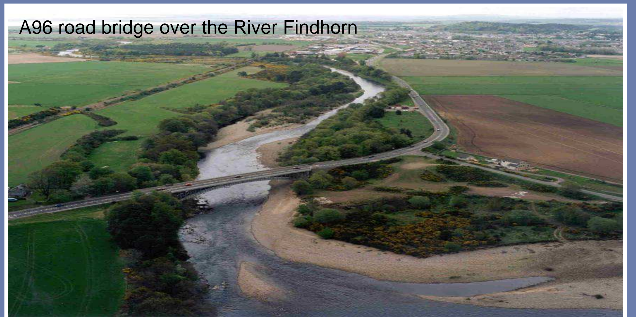
A96 road bridge over the River Findhorn

Staff from the Moray Council and its partner organisations are on hand today to answer any questions you may have