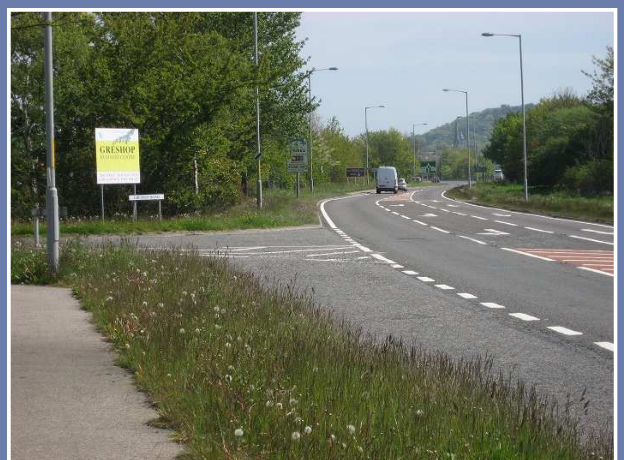
Junction to be upgraded with a roundabout to improve access