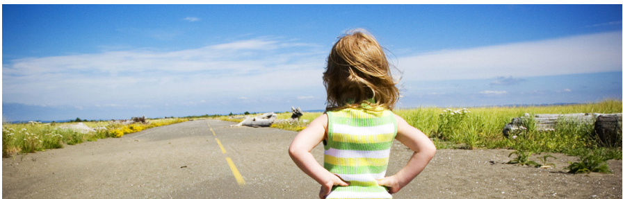
Wales Autism Research Centre (WARC)