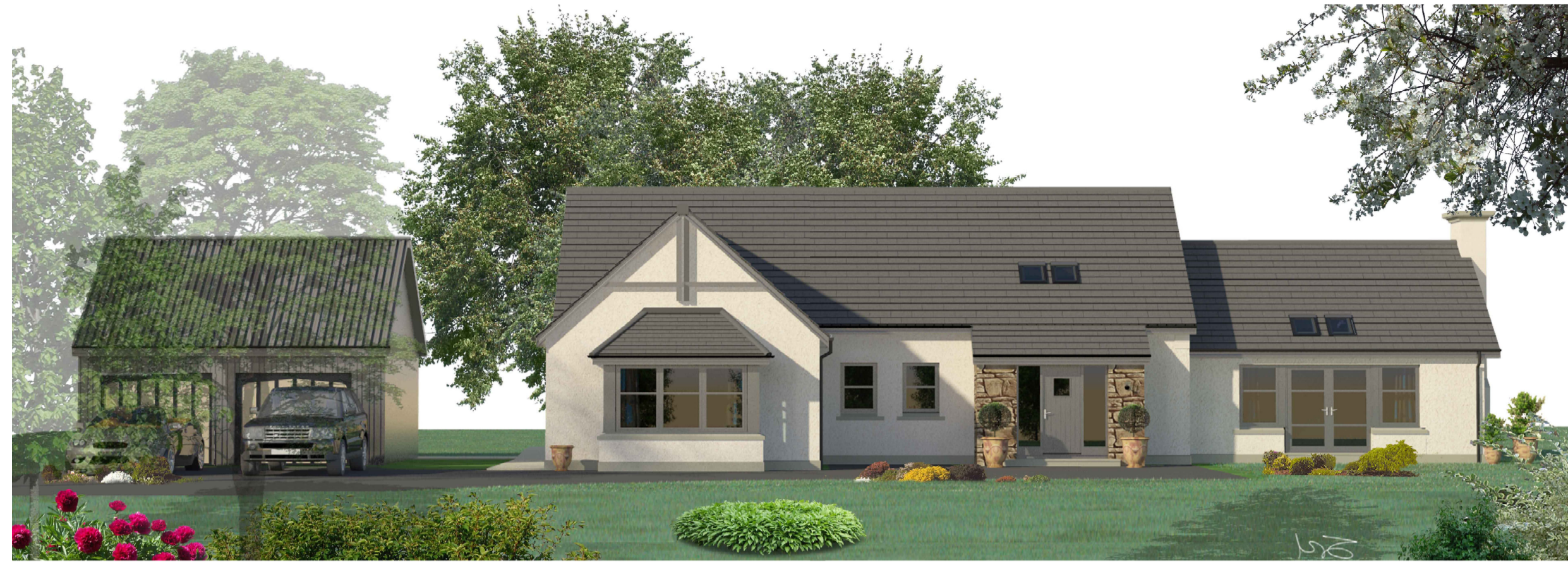
Typical 3d image of house design Produced using TurboCAD V.18 professional, 3DS max design 2011 and Photoshop