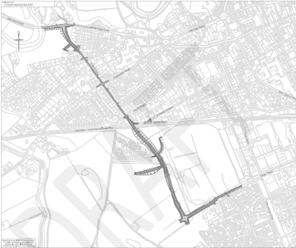
Plan of Scheme

3.1. The Scheme will extend from the end of Edgar Road, in a westerly direction before turning north and over the Aberdeen – Inverness railway line. The Scheme will then utilise the existing Wittet Drive until it deviates to join the A96 Aberdeen – Inverness Trunk Road at a point approximately 100m west of its existing junction.