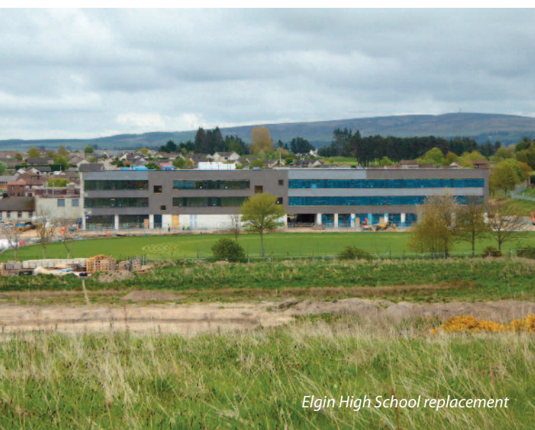
Elgin High School replacement

The Quality Audit process has started to deliver results as a number of residential developments over the last 12 months have been through this collaborative assessment which is