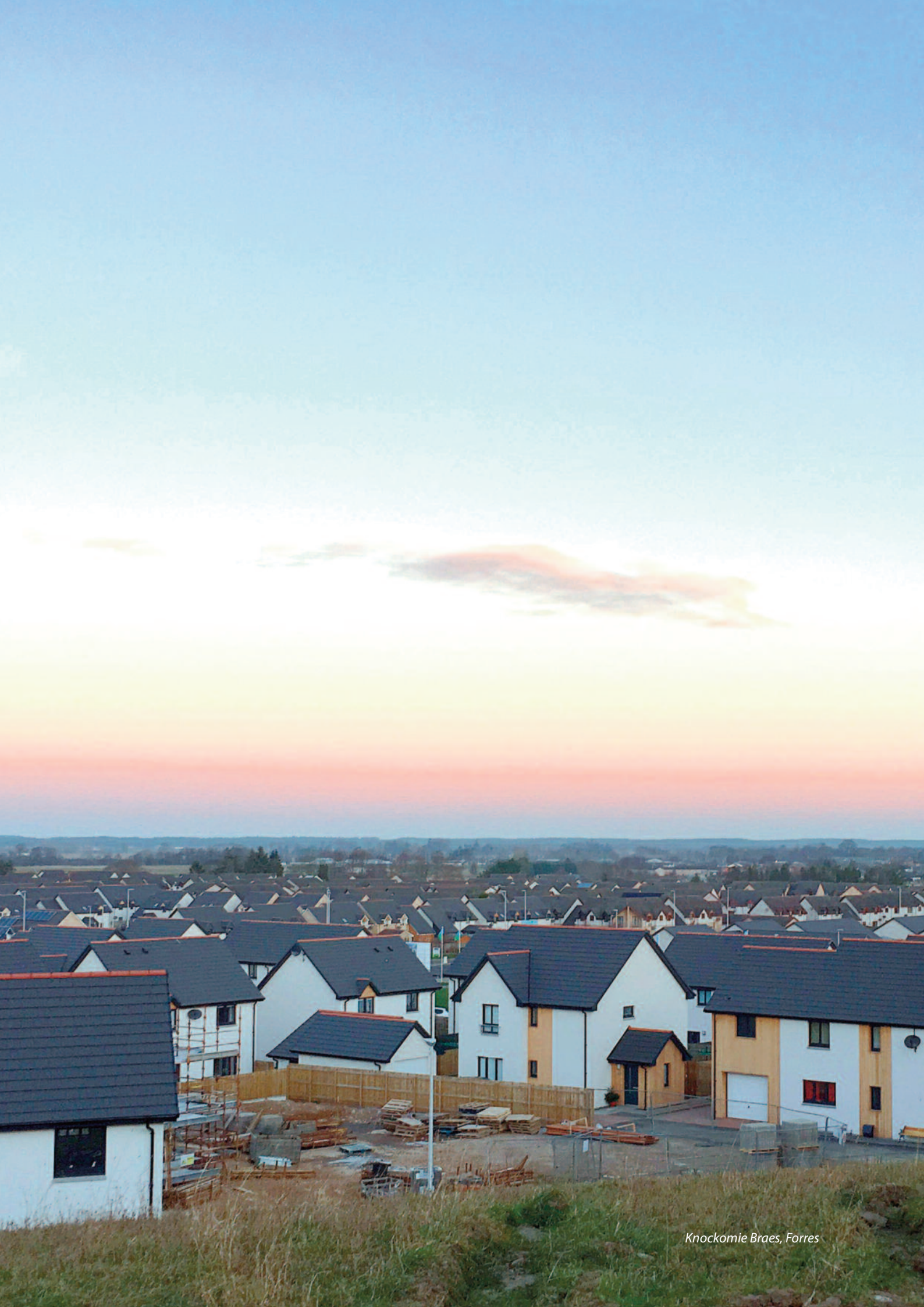
Knockomie Braes, Forres