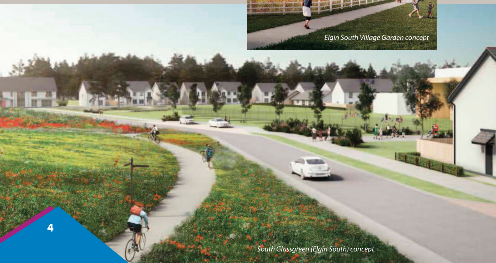
South Glassgreen (Elgin South) concept