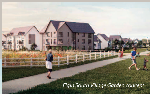
Elgin South Village Garden concept

Viability was a key issue in determining the application and developer obligations of £5.6 million were secured towards mitigation of the impact of the development on education and healthcare infrastructure. Collaborative working was also key to the success of this project, with the developer's project team meeting with the Council project team on a regular basis.